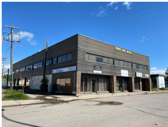
4926 1 Avenue, Edson, AB

Upstairs Total Exterior Area 10294.32 sq ft Total Interior Area 9995.42 sq ft