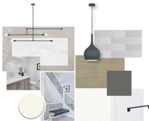
#2B, 3550 45 STREET SW MOOD BOARD - FINISHES & SPECIFICATIONS

*Images are for inspiration purposes only.