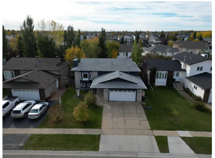
121 Berens Pl, Fort McMurray, AB

Looking for a quiet place to retreat? The primary bedroom is large enough for a king-sized bed, with a big closet and a 3-piece ensuite for extra convenience. The main bathroom has been updated with a renovated