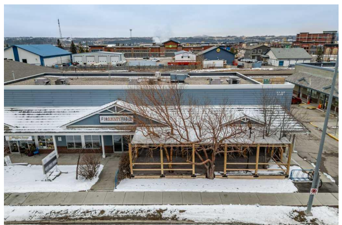
185 1 St E, Cochrane, AB

Main Floor Exterior Area 4639.87 sq ft Interior Area 4485.18 sq ft