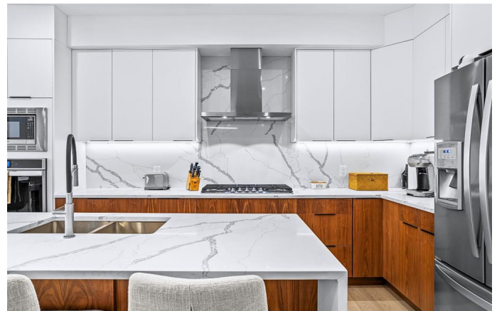
THE CHEF-INSPIRED KITCHEN IS AN ABSOLUTE SHOWSTOPPER