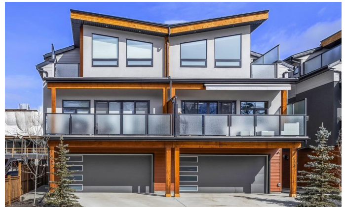
WELCOME TO UNIT 1 AT 826 7TH STREET IN CANMORE ALBERTA

With four spacious bedrooms and four luxurious bathrooms, this home is designed for comfort and convenience. Three of the bedrooms feature their own ensuites, ensuring privacy and luxury for each resident or guest. Whether you're waking up to a mountain