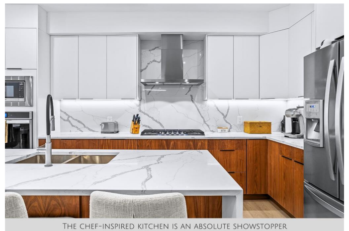
THE CHEF-INSPIRED KITCHEN IS AN ABSOLUTE SHOWSTOPPER