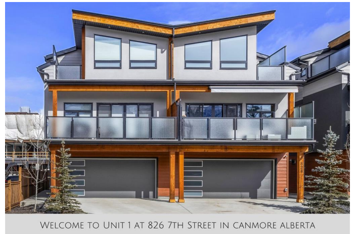
WELCOME TO UNIT 1 AT 826 7TH STREET IN CANMORE ALBERTA

With four spacious bedrooms and four luxurious bathrooms, this home is designed for comfort and convenience. Three of the bedrooms feature their own ensuites, ensuring privacy and luxury for each resident or guest. Whether you're waking up to a mountain