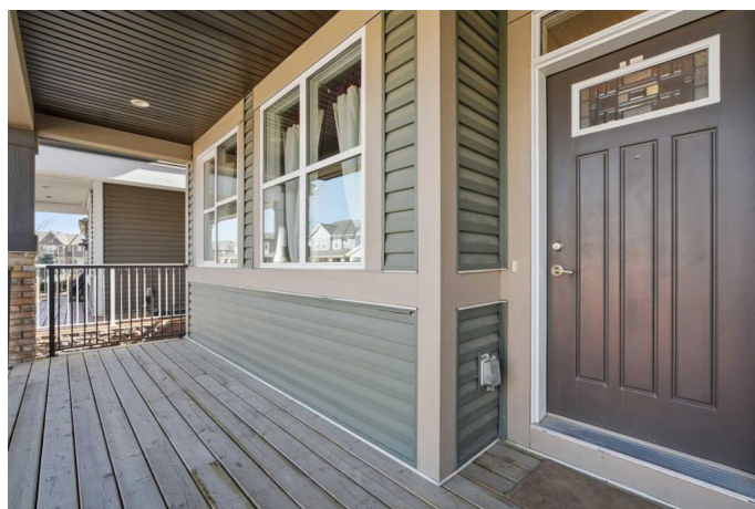
41 Legacy Glen Row SE, Calgary, AB

Main Floor Exterior Area 758.08 sq ft Interior Area 691.29 sq ft